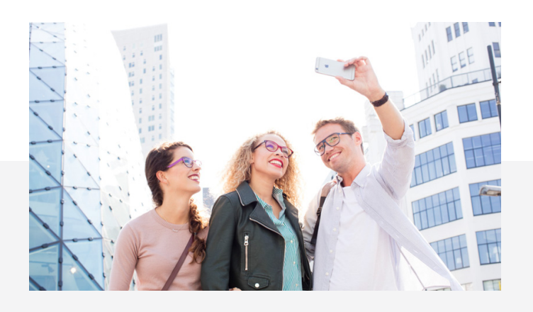
√ Tip - Make sure to avoid reflections and shadows from your glasses when taking the selfie.