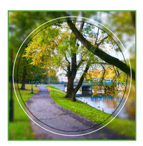
ID SINGLE VISION BI-ASPHERICDESIGN