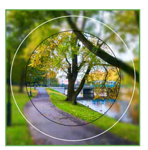
TRADITIONAL ASPHERIC DESIGN